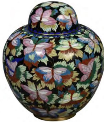
Butterfly Cloisonné Eckels 832 Handcrafted from copper, applied enamel finish (8" d x 9.25"h) $ 825.00