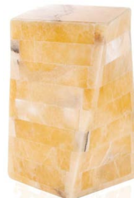
Onyx Torsado Joyal & Allard 249500B Natural Stone (7" w x 7" d x 10" h) $ 595.00