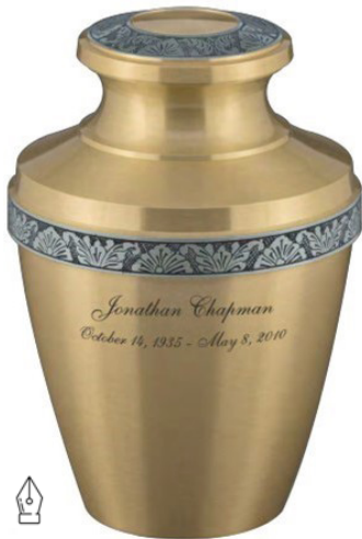
Odessa Bronze Floral Eckels 511L Custom spun brass urn with bronze & brushed finish and floral band accent (7.25" d x 10" h) $ 740.00