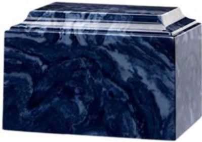
Navy Classic Urn Eckels 213 Cultured Marble (9.7" w x 6.7"d 6.5"h) $ 455.00

* based upon availability, taxes not included