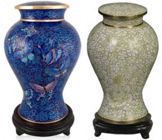
Elysse Cloisonné Blue Eckels 160L - Opal Eckels 162L Highly polished cloisonné urn in assorted hues (7" d x 11" h) $ 825.00