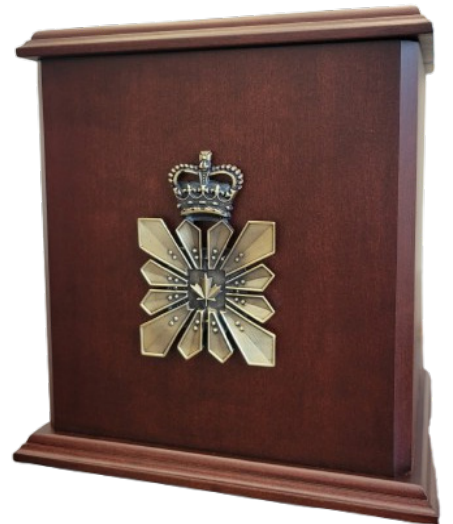
RCMP, CSIS or Canadian Armed Forces Regimental Barn & Stable Urns Solid Oak or Cherry (8.3" w x 8.5" d x 10.5" h) $ 895.00

All urns listed are standard adult size.