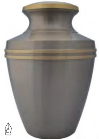
Odessa Pewter Eckels 512L Custom spun brass urn with pewter & brushed finish and double band accent (7.25" d x 10" h) $ 740.00

All urns listed are standard adult size.