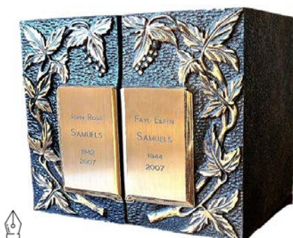
Book & Vine Eckels ZB071 Zinc and Bronze (4.5" w x 7" d x 8.5" h) $ 1,265.00 (each)