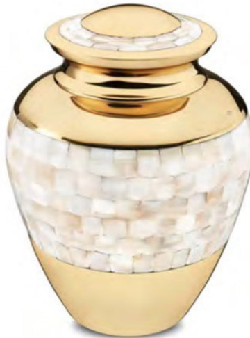
Mother of Pearl Eckels MOP Handcrafted from brass with applied pearl finish (7" d x 9.25" h) $ 595.00