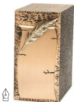
Scroll & Quill Eckels ZB072 Zinc and Bronze (4.5" w x 8" d x 8.5" h) $ 1,265.00

* based upon availability, taxes not included