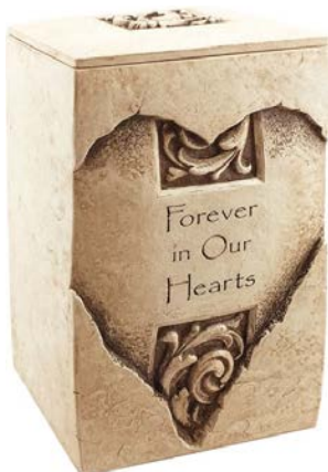
Heart Victoriaville US899-30110 Natural Stone (6.75" w x 6" d x 11" h) $ 1,023.00