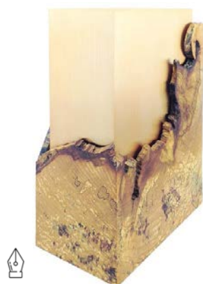
Eclisse Galet Bronze Victoriaville US-899-00012 Available in bronze or aluminium (4.1" w x 7.6" d x 9.9" h) $ 1,126.00