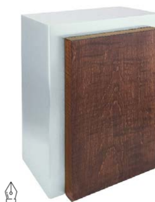
Zenalu Victoriaville US440-20011 Metal and wood (6.75" w x 4.6" d x 9.1" h) $ 830.00

All urns listed are standard adult size.