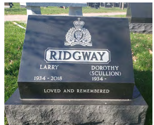
RCMP Cremation Grave Package

4 x 5 Up to 4 urns. (Black Pillow Monument Included)