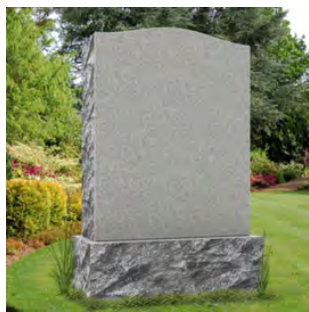
$ 4,270.00 Plus HST

Light Barre Grey monument, Steeled 22" x 6" x 28" - Stanstead Grey base 24" x 12" x 8"