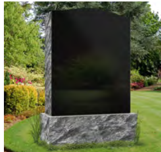
$ 4,650.00 Plus HST

Jet Black monument, polished front and back 22" x 6" x 28" - Stanstead Grey base 24" x 12" x 8"